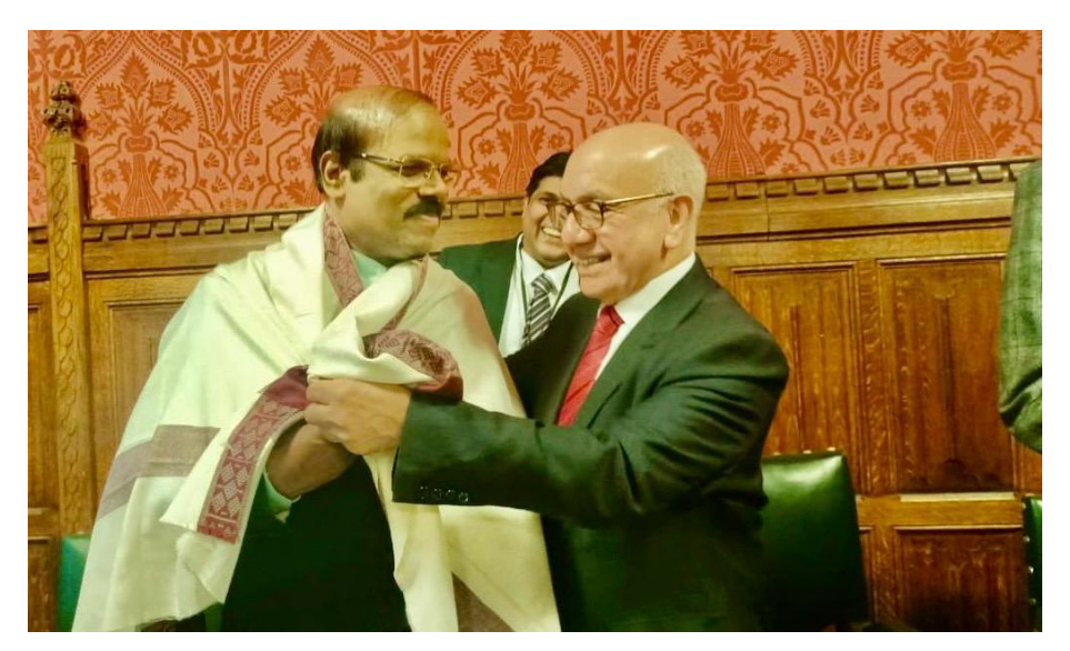
Hugged by the British MP after the presentation of "Dimensional Progressive Theory"