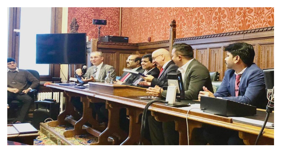
Felicitation after the presentation of Dimensional Progressive Theory